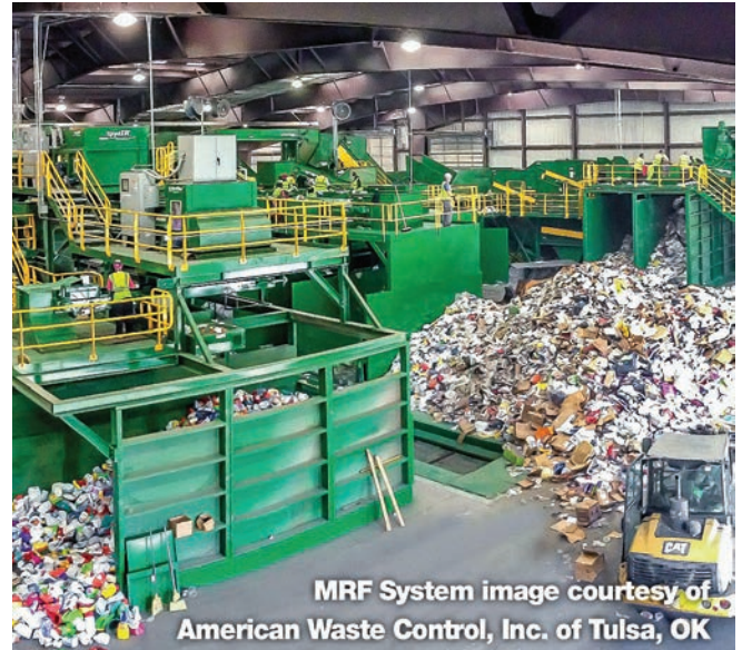
MRF System

To begin designing a MRF for your business or community, or to expand the capabilities of your existing recycling program, contact Marathon Recycling Solutions at MarathonRecyclingSales@MarathonEquipment.com .