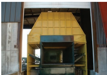
Transfer station compactors can be configured with custom hoppers and feed systems.