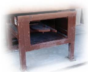
Extending Hydraulic Scissor Connector

Marathon Transfer System Compactors can be fitted with a variety of options, such as trailer connection systems, to suit your application. The hydraulic scissor extends to connect to the trailer's vertical pin latch. The hydraulic grab claws hold the trailer, using their side pockets. Marathon also offers EZ-TRAX Conveyors for an efficient way to feed your transfer system. Load cells can be utilized to keep track of the weight as the compaction trailer is being loaded to maximize payloads.