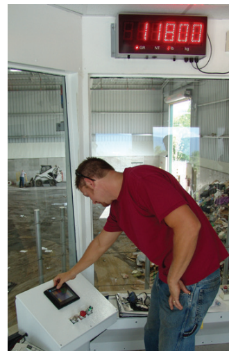
The BlokPak 3000 control station features a color touch-screen interface. This installation also has an integrated weighing system that displays the accumulating weight on-screen and on overhead monitors while the waste is being processed.