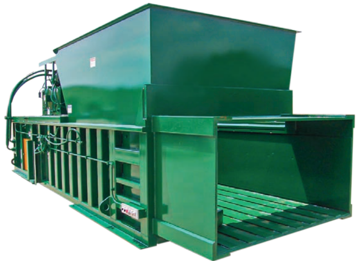
M-Series 1475XW compactor