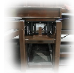
*Load Cell Weighing System Only available for BlokPak3000