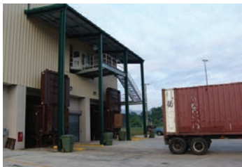
This transfer station, located in Salem, VA, features two BlokPak 3000 compactors for non-stop processing as well as added redundancy. They are fed from a tipping-floor.