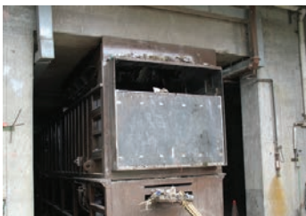
This M-1475XW Transfer Station Compactor is fed via a tipping-floor and features the Scissor trailer connection system.