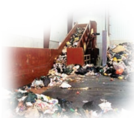
EZ-TRAX Conveyor System